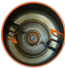
Drum with reinforced opening and 2 double mixing blades