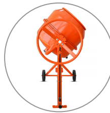
Handles for discharge