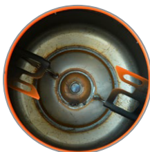
Drum with reinforced opening and 2 double mixing blades