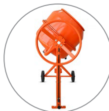
Handles for discharge