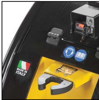
Dashboard starter and fast handle attachment