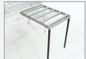
Side bench with rollers