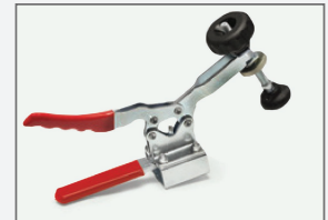
B-Lock for thickness up to 40 mm