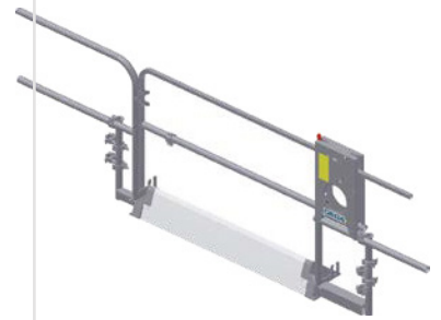
Comfort Art. No. 01212