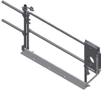
Standard Art. No. 01217