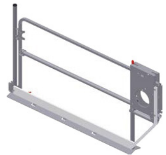
Standard-Basic Art. No. 01268