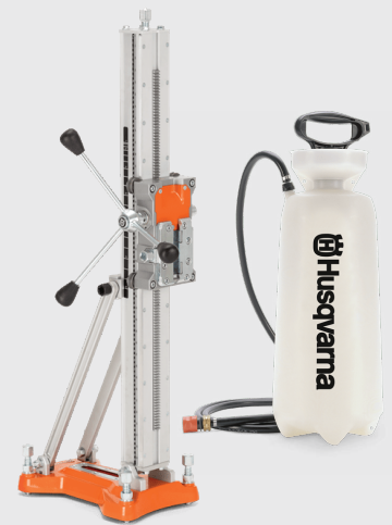
DS 500 Pressurized water tank (Optional)