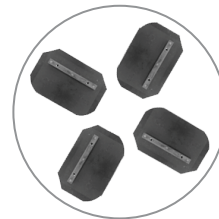
Finishing blades (optional)