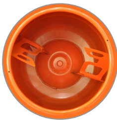
Drum with reinforced opening and 2 double mixing blades