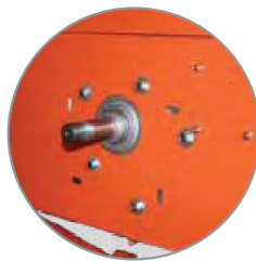
Drum rotation without gear ring